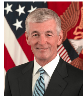
The Honorable Gordon H. Smith President and CEO, National Association of Broadcasters Action Alliance Private Sector Co-Chair

A handwritten signature in black ink, appearing to read "John M. McHugh".